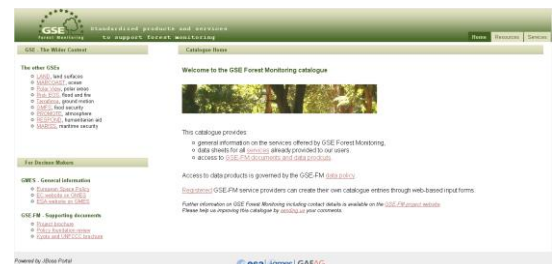
GSE FM services catalogue